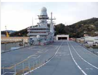
Examples of installations

Always on the technological forefront CONRAC develops and manufactures custom-tailored display solutions. A multitude of mechanical and electronic configurations is available, e.g. monitor-only versions, integrated PCs, integrated touch screens, etc.